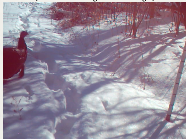
a turkey to go