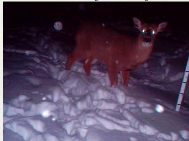
a doe ("What was that flash?")