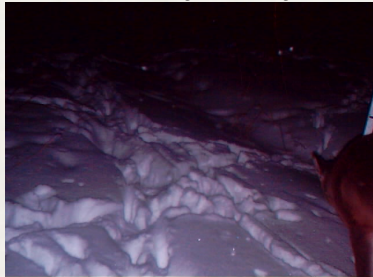
a cougar? no!