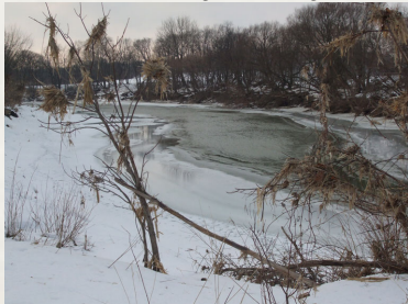
the river aflow (note the cornstalks deposited in small tree by last flood)