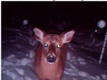
(. . . and again.)