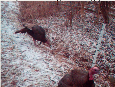
cam 3 catches a turkey . . .