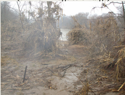
I have never seen even half this much riverdrift on the landing after a flood: that stuff up in the trees was put there by the river ! (in background)