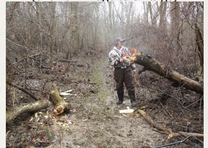
Brian finishes off the willow trunk