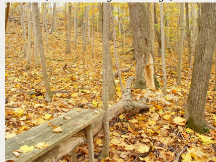
Pileated Woodpecker "dig" on side of rotted Bitternut tree