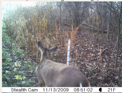
doe caught by trail cam as she enters picture zone at 7:51 am (EST) last friday morning