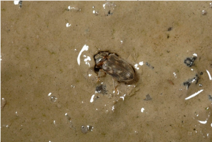
A Heterocerid (Mud-loving) beetle which, evidently, loves mud! This particular individual appears to be Neoheterocerus sp. (AKD)