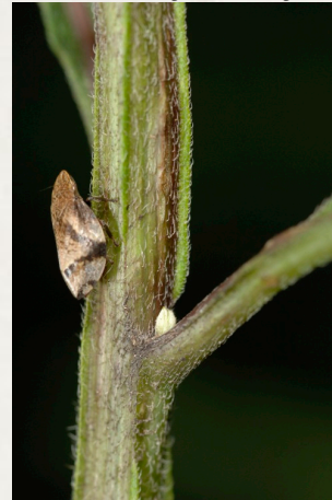
The 'Diamond-backed Spittlebug' or Lepryonia quadrangularis is normally covered with "spittle" as it hugs a plant stem, sucking out fluids from the tracheids or conducting vessels within the stem. (Cercopidae -- Spittle Bugs) A rare glimpse of a common insect! Head of creature points up here, with eyes just under a shieldlike covering.