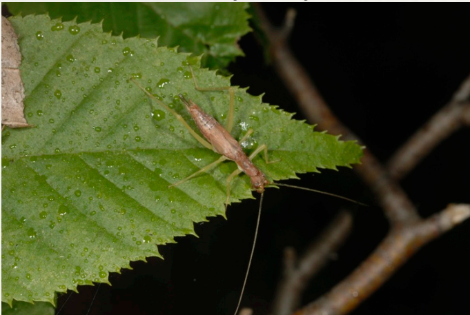
The Two-spotted Tree Cricket or Neoxabea bipunctata is a tree cricket (fam. Gryllidae subfam. Oecanthinae) This and other Tree Crickets sing from bushes and plants during the middle-to-late summer, some during the day, some at night.