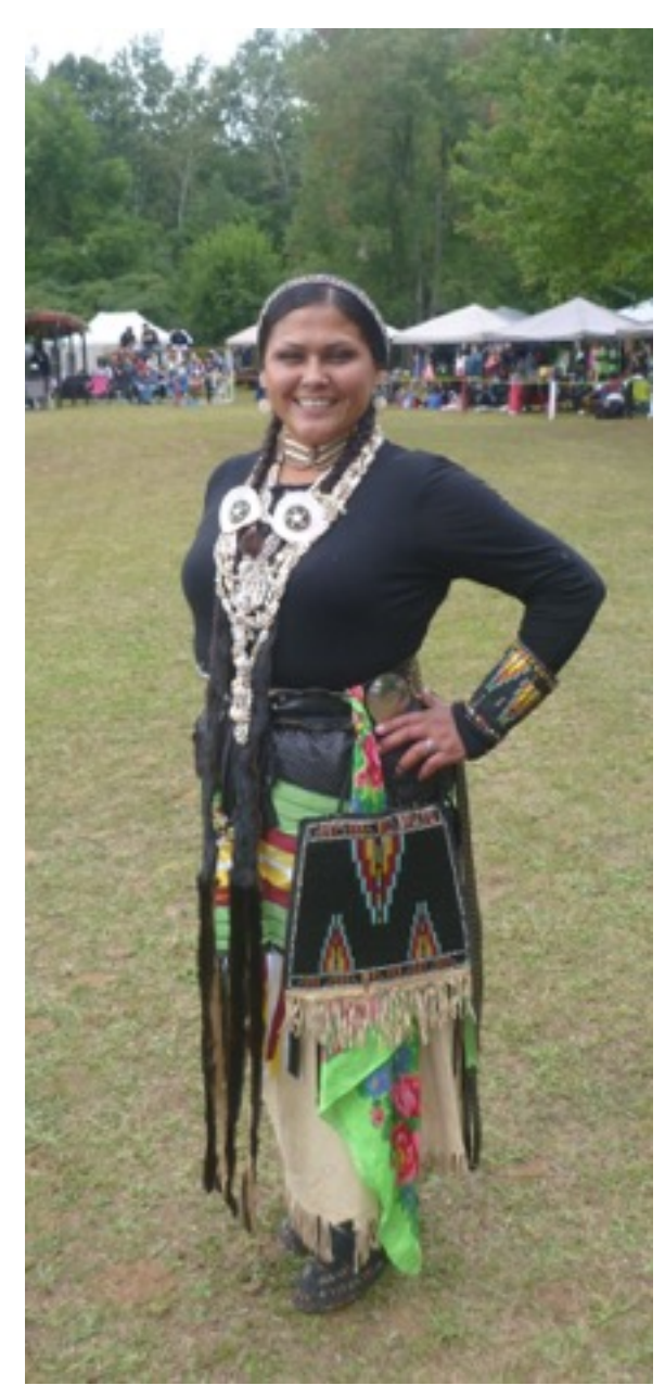
More conservative (and authentic) outfits were worn by this man from the Brantford Six Nations Reserve and a Delaware woman in her finery.